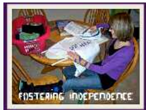
Three of the 10 winning photo submissions from the University of Western Ontario team for the 2009 gOT Spirit Challenge held in October.